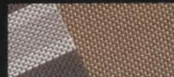
Vistaweave unique fabric allows for air flow and does not trap heat.